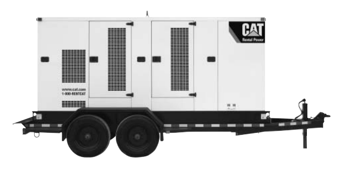
Arrangement shown with optional trailer